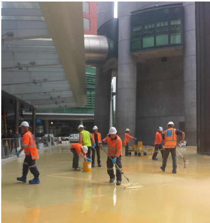
Sikafloor-375, Abrasion layer being applied at the Sky Hotel Entrance